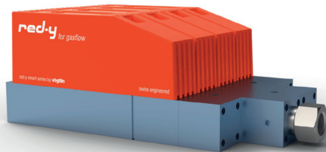
Fig. 3 Vögtlin offers modular MFC systems based on your demands and requirements.

Inflow gas should be maintained at a very stable level in the coating process to avoid uneven coating and significant spots and negatively impacting the general energy of particles in the coating, which is not favorable for reactive deposition. A complicated gas distribution system requires numerous of process gas branches. Installation and commissioning of single channel gas circuits are tedious with heavy work load. In addition, this system typically reduces efficiency, and generates multiple leakage points. Human operation errors (wrong connection of gas mixing and connection circuits) also can negatively impact operations.