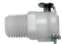
Typical shown: 1/4" NPT Male Pipe Thread with Shut-off Valve

These adapters are available with or without an integral shut-off valve. The shut-off valve will stop line flow when the adapter is removed from the unit. Flow resumes when connected.