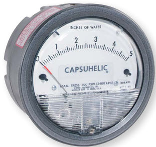
Capsuhelic® pressure gage has a large, easy-to-read 4" (102 mm) dial.