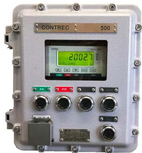
500 Series in BZC Ex d enclosure

* These variables are logged and can be printed but are not shown in main menu.